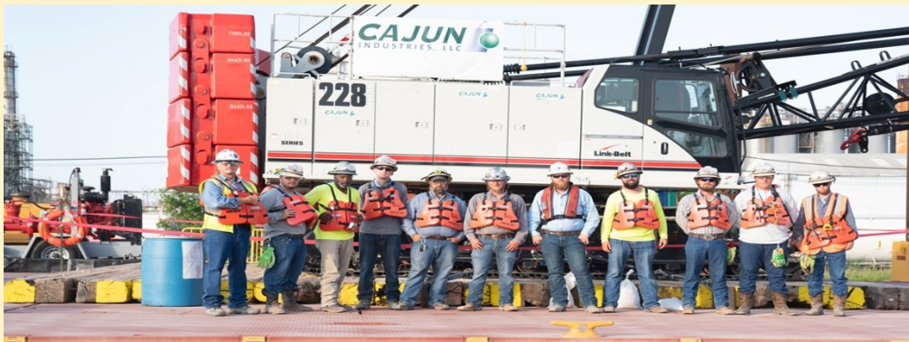
22-507 ExxonMobil Raw Water Intake Structure

The crew at Exxon recently completed an extremely challenging project involving installation of a temporary sheet-pile coffer dam in an existing waterway. The project utilized Cajun's Geiken Silent Piler and depended on a well-executed JHA which the crew followed with precision and skill.